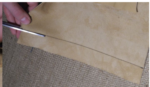
Illustration 17: Draw a straight line across the rear of your moccasin from point to point and trim. REMEMBER: this should be HALF the overlap measured!