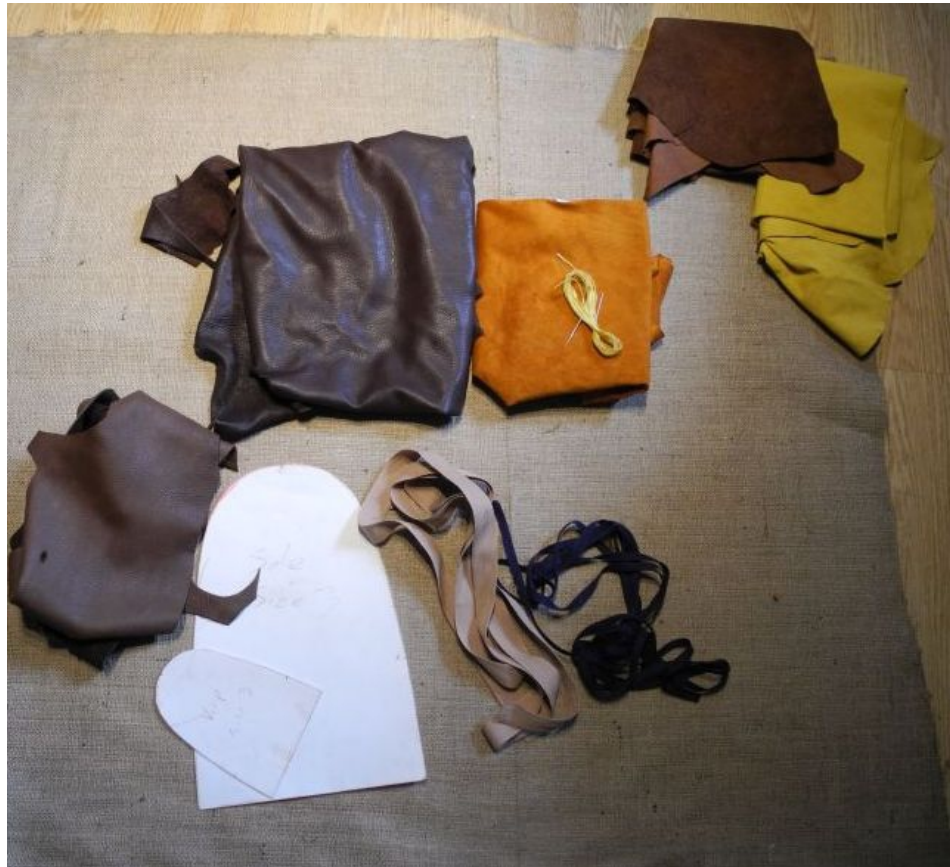
Illustration 4: Everything included in a "buckskin upper" moc kit. Note: There are a variety of deerskin and boar skin colours to choose from.