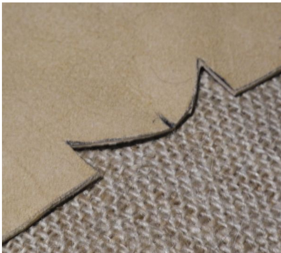
Illustration 18: The "heel crescent", drawn and cut out at the rear of the moccasin.