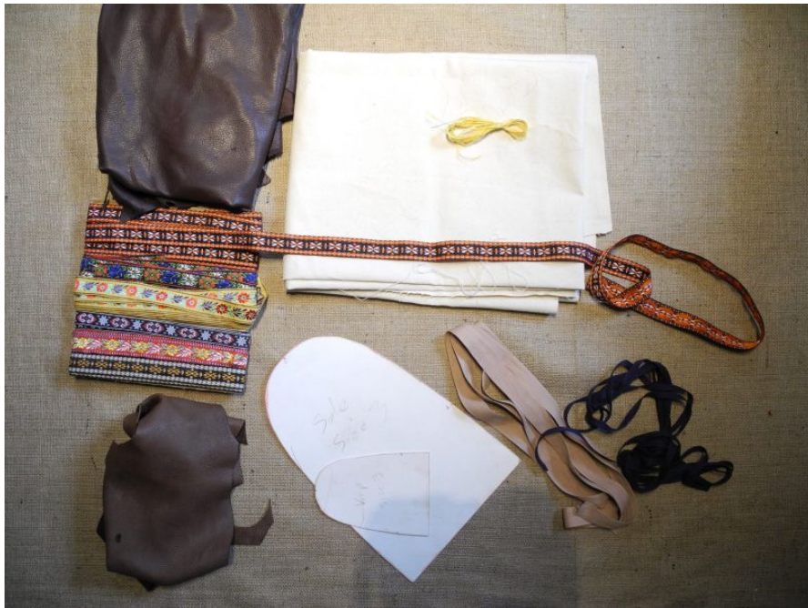
Illustration 3: Everything included in "canvas upper" moc kit. Note: there are a variety of deerskin colours and decorative ribbons available.