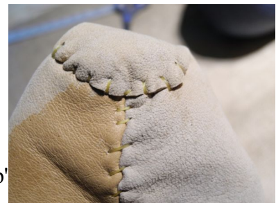
Illustration 20: The finished heel seam - showing a "closed" whip stitch.