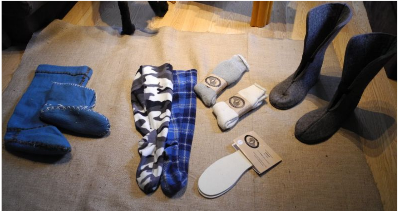
Illustration 6: Various liners we use and sell. From L-R: Wool blanket liners, fleece over-socks, thermohair socks and insoles & felted wool boot liners.

These moccasins are the outer 'shells' of a complete, warm, footwear system. A crucial piece of the puzzle, but alone they will do very little to keep your feet warm. You also need to provide enough insulating layers for the temperatures you intend to travel in. A typical winter footwear system for the winter woods would include: