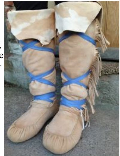
Illustration 1: Winter Moccasins made from a Lure of the North kit, by Farafoot Bushcraft, Shropshire, UK