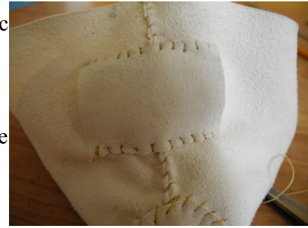
Illustration 21: Simple lacing tab.