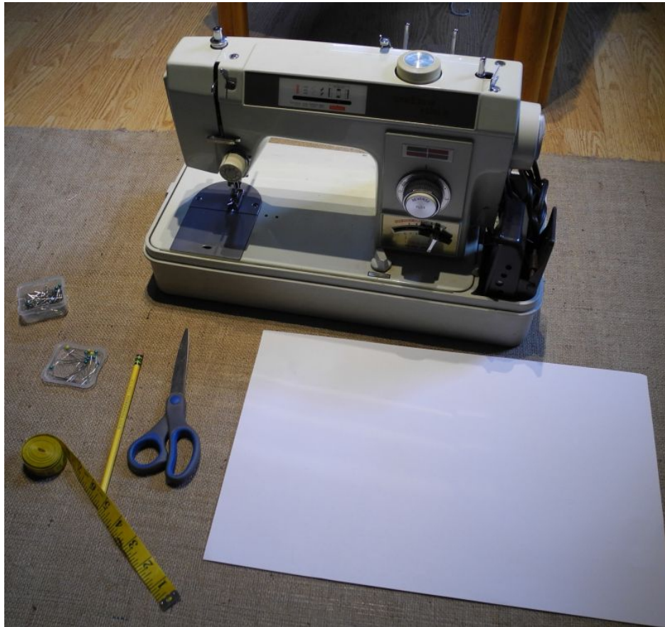
Illustration 5: You need only supply a few standard household items.