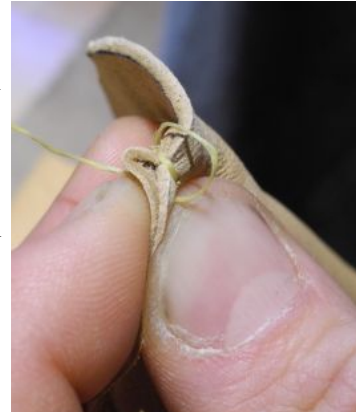
Illustration 12: The first pucker stitch