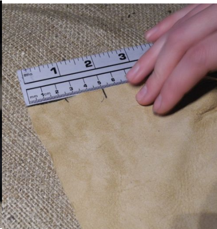
Illustration 16: Divide that overlap by two and make a new mark.