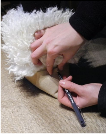
Illustration 15: Have a friend wrap the moccasin around your heel and mark the overlap.

7. Your moccasins are now perfectly sized to your foot and are ready to be completely sewn.