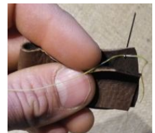
Illustration 7: First stitch: "Hiding the Knot"