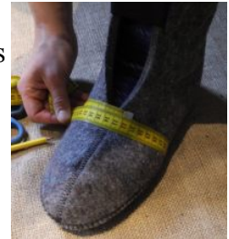
Illustration 9: Measuring foot circumference ("C")

Put on all your insulating layers, except your felt insole, and measure the circumference around the arch of your foot as shown in the photo. We will call this measurement “C”. Now refer to the sizing chart provided. Find the pattern combination that best meets your measurement. If you are in between sizes then adjust by cutting on the inside or outside of the line on the sole portion of the pattern.