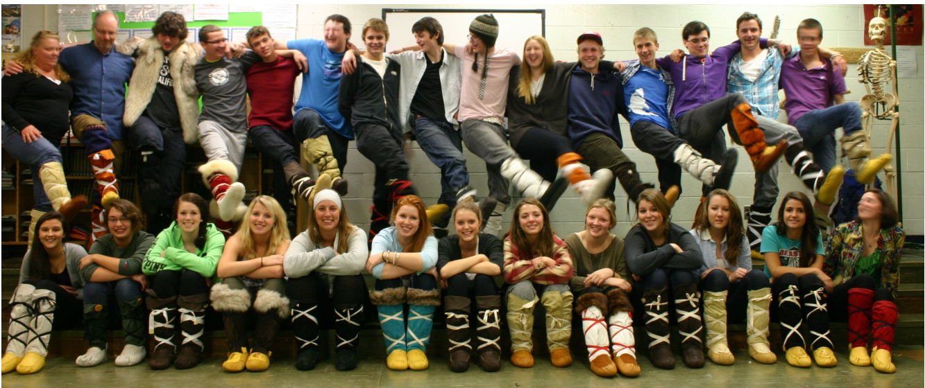
Illustration 2: Happy moc-shop participants from Georgian Bay Secondary School's Pursuits Program

Making moccasins yourself gives you an opportunity to customize and personalize them to your heart's content. This can be elaborate ornamentation, including bead work, burning and the like, or simple elegance. Check out the beautiful moccasins to the right made by Farafoot Bushcraft of Shropshire, England ( http://www.farafoot.co.uk/ ) using one of our moccasin kits and some innovations of their own. The skills learned in making these moccasins will give you the knowledge and confidence to repair them and other equipment in the field. And of course, this is an opportunity to connect with the heritage of our land and those that have travelled it before us.