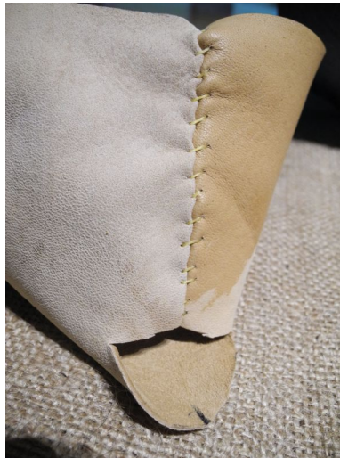
Illustration 19: The flattened seam