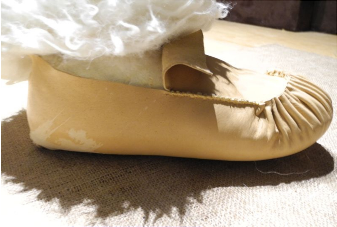
Illustration 22: Our completed lower - ready for a top!