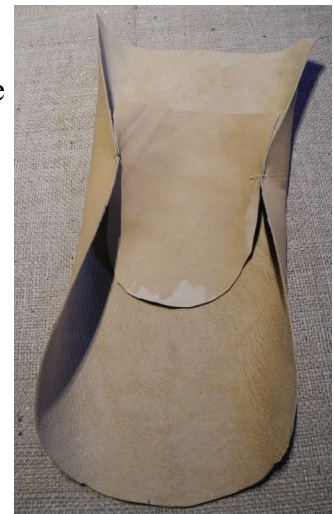
Illustration 11: Sole and vamp - tacked and ready to go!