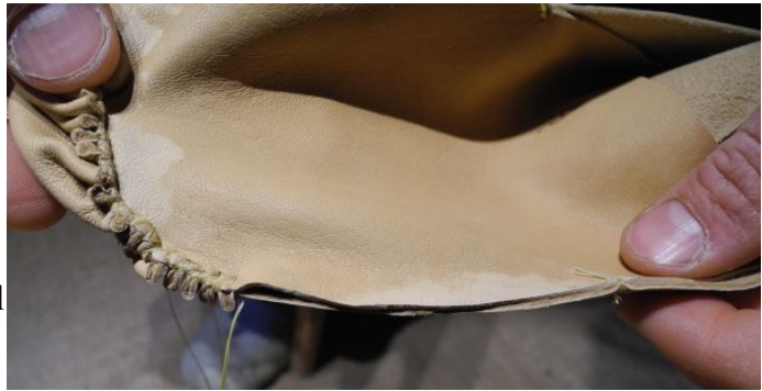
Illustration 13: Once the vamp and sole line up as shown, you are finished puckering!