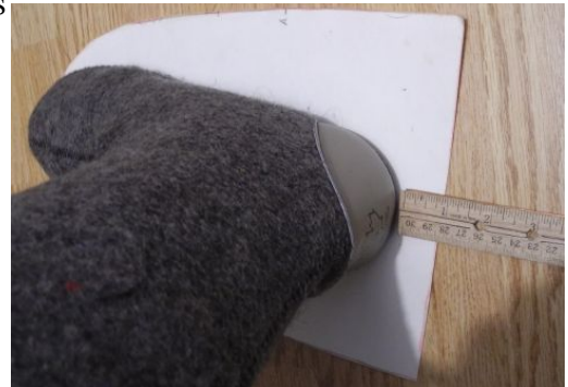
Illustration 10: This pattern is too short, and should be extended ~ 2”.

Once you have sized your pattern to the appropriate width it is time to ensure adequate length. Measure the length of your foot (wearing your insulating layers) from toe to heel. The length of your “sole” pattern piece (measurement “L” in the diagram above) should be ~3” longer than the length of your foot. If it is not, increase the length of your sole piece, straight back, as much as necessary.