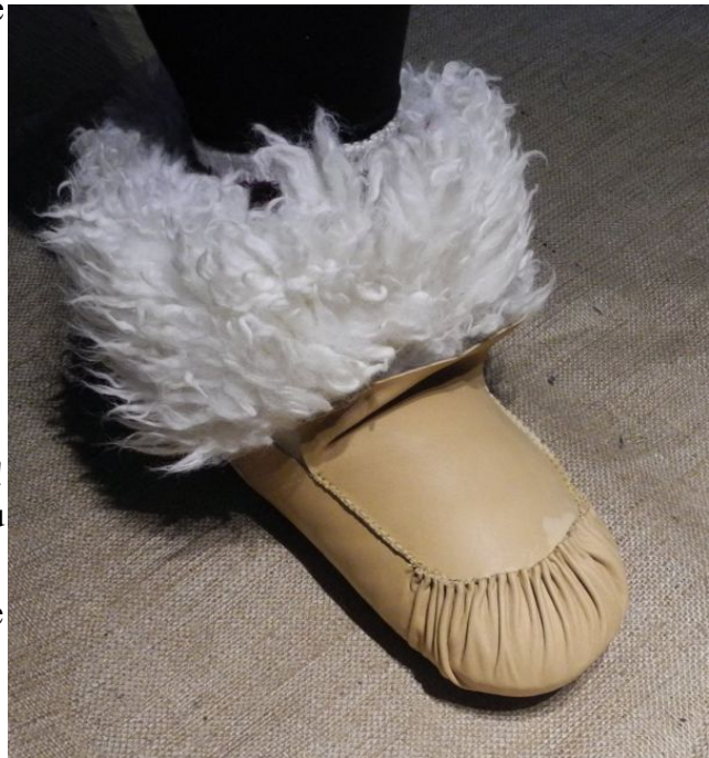
Illustration 14: Toes complete! Deerskin moccasin with sheepskin liner (aka "Shleepers").

While the pucker is still fresh in your mind, complete the toes of your other moccasin. You are now done doing pucker stitches. Phew!